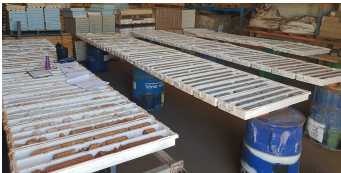
Figure 01: Magnetite Range Core Geological Zonation Exercise of MGD045 Nagrom Labs 2019

The Company remains committed to development of the project and continue to review land access, logistics, infrastructure and corporate options moving the project continually towards PFS.