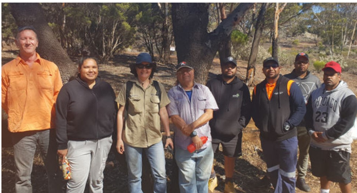
Figure 02: Norseman Project – Native Title Heritage Survey Crew September 2019

Mining Lease Agreement Native Title negotiations for MLA63/657 have again commenced with another assigned NNTAC lawyer to the project. Accent have requested a copy of a new Ngadju Native Title draft agreement for review and is currently awaiting feedback from Ngadju Native Title Lawyers and NNTAC.